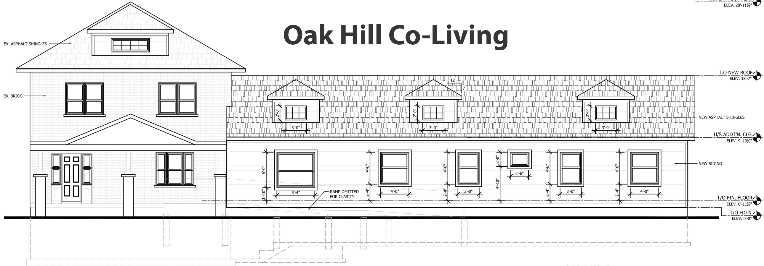
PROPOSED NORTH (front) ELEVATION